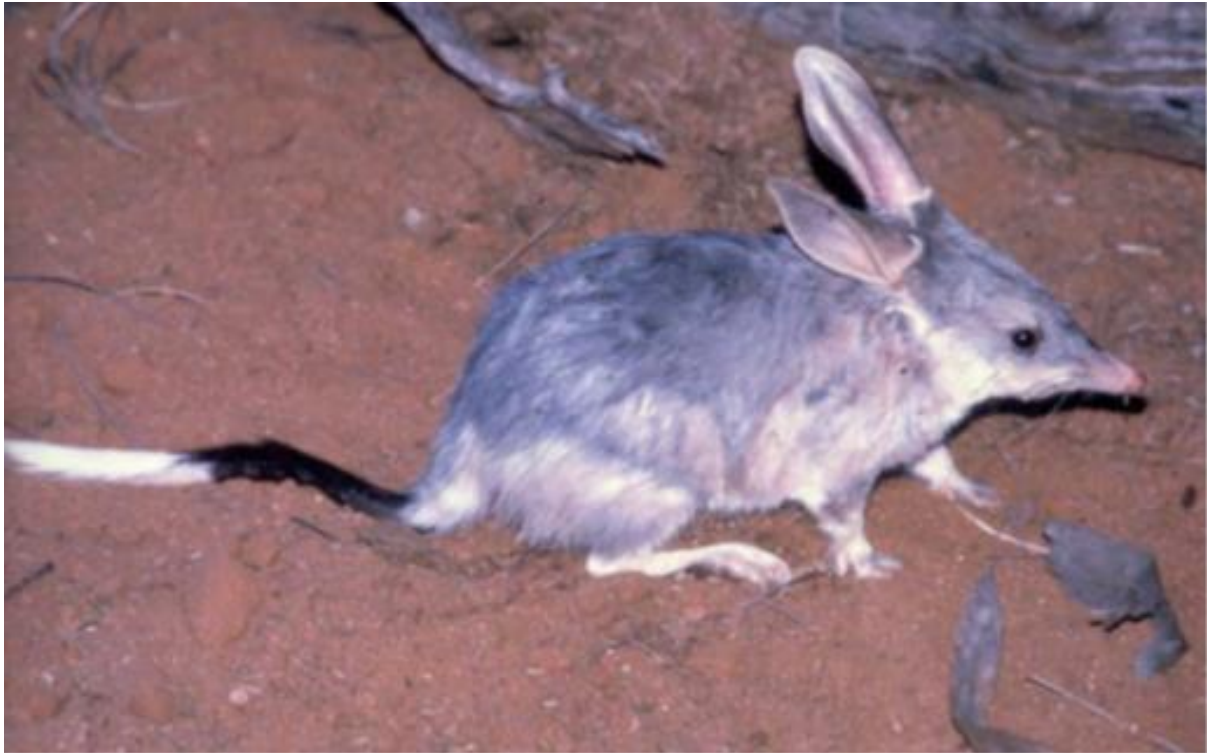
Greater Bilby.

The greater bilby ( Macrotis lagotis ) is a small (rabbit sized) marsupial from Australia's bandicoot family. It has a pointed snout, long pinkish ears, a long black tail with a white tip, and strong forelimbs and claws for burrowing and digging up food. Males are much larger than the females and can be up to 2.5 kg in weight. Each bilby moves between up to 12 burrows in their home range in response to food availability.